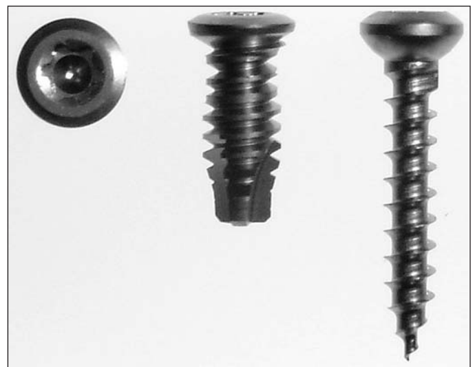
Fig. 4 ALPS screws. On the left side is a view of the Torx®-compatible screw head. The 2.4 mm locking screw in the middle shows the cone shaped head, the special threads and the diameter of the screw. A conventional 1.5 mm self-tapping screw is on the right side.