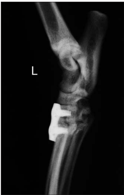
Fig. 8 Medio-lateral view of the left tarsus, postoperative radiograph.