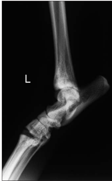
Fig. 6 Medio-lateral view of the left tarsus, preoperative radiograph.