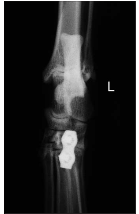
Fig. 7 Dorso-plantar view of the left tarsus, postoperative radiograph.