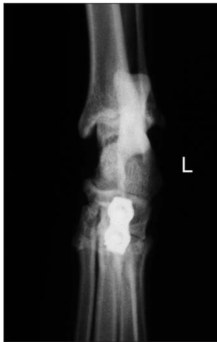
Fig. 9 Dorso-plantar view of the left tarsus, radiograph six weeks postoperative.