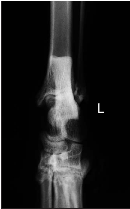
Fig. 5 Dorso-plantar view of the left tarsus, preoperative radiograph.