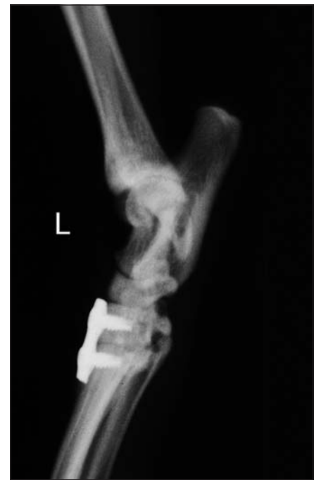
Fig. 10 Medio-lateral view of the left tarsus, radiograph six weeks postoperative.